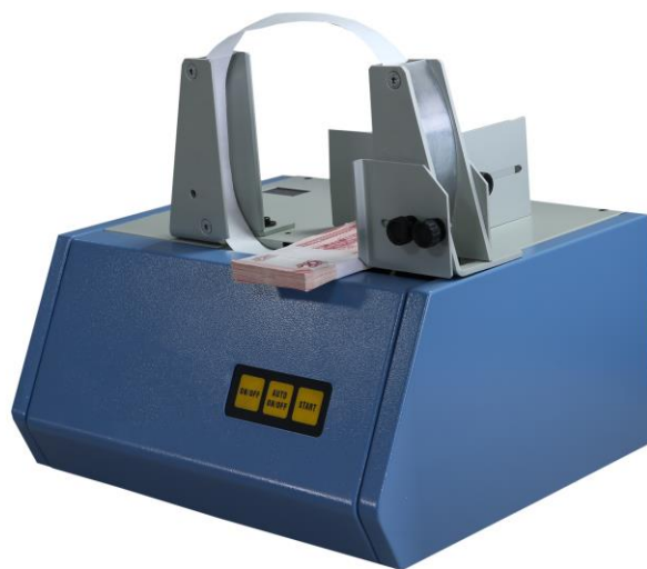
BM S200 paper