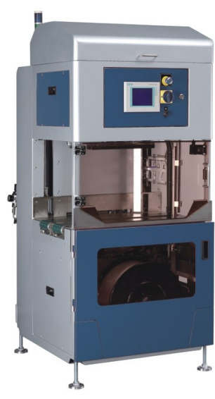
SM 702 NL in line