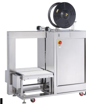
SM 601 YAM