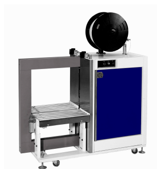
SM 601 YA